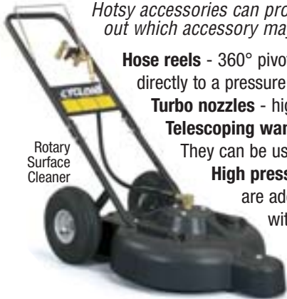
Rotary Surface Cleaner

Rotary surface cleaners - designed for use with most hot and cold water pressure washers, and are ideal for cleaning floors, parking lots, warehouse floors, trailer floors and more.