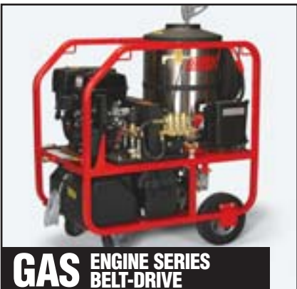
GAS ENGINE SERIES BELT-DRIVE