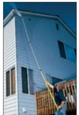
Telescoping wands extend to 24' to reach high places without scaffolding