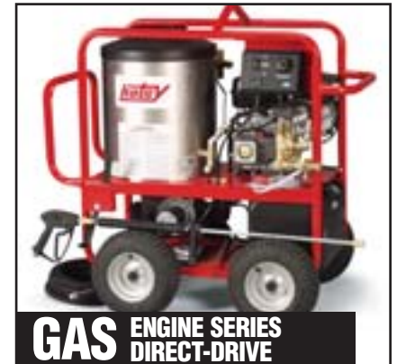
GAS ENGINE SERIES DIRECT-DRIVE